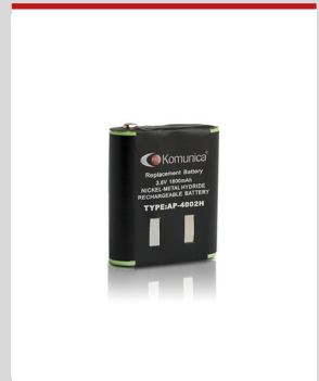
AP-4002-H / HKNN4002A

TALKABOUT / T-82 / T-82-Extreme / T-62 / T-5320 / 5400 / 5420 / 5522 / 5600 / 5620 / 5700 / 5710 / 5720 / 5800 / 5820