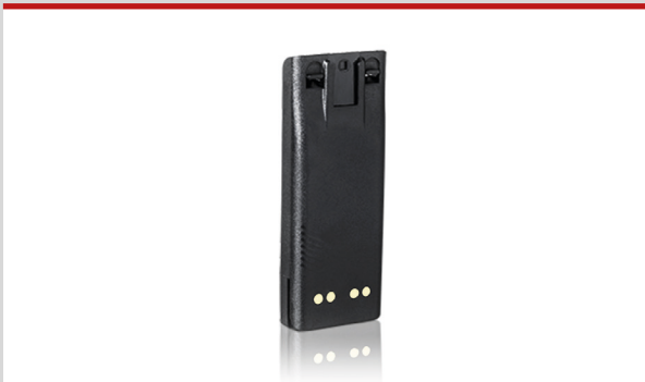
AP-2000-H / NTN7144

GP-900 / 1200 / HT-1000 / MT-2000 / MTX-2000 / 8000 / 9000 / 838 / MTS-2000 / MTZ-2000