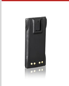
AP-318-Li / HNN9013

GP-140 / 240 / 280 / 280 / 320 / 330 / 338 / 340 / 360 / 380 / 580 / 640 PRO SERIES HT-750 / 1250 / 1550 / MTX450 / 900 / 960 / PRO5150 / 5550 / 7150 / 9150