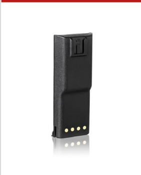
AP-300-H / HNN9628