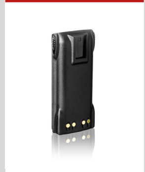
AP-328-H / HNN9008